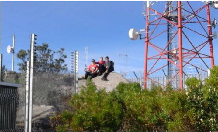
Witteklip (Lady's Slipper) repeater site