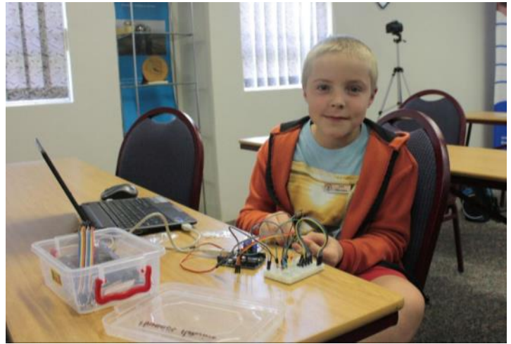
Glen ZU6G learning to programme and build simple circuits using Arduino.

Arduino is an open source platform used for building electronic projects. Arduino consists of a programmable microcontroller and software that runs on a computer. This software uploads the code to the microcontroller, which in turn controls, sensors, motors, electronic circuits etc.