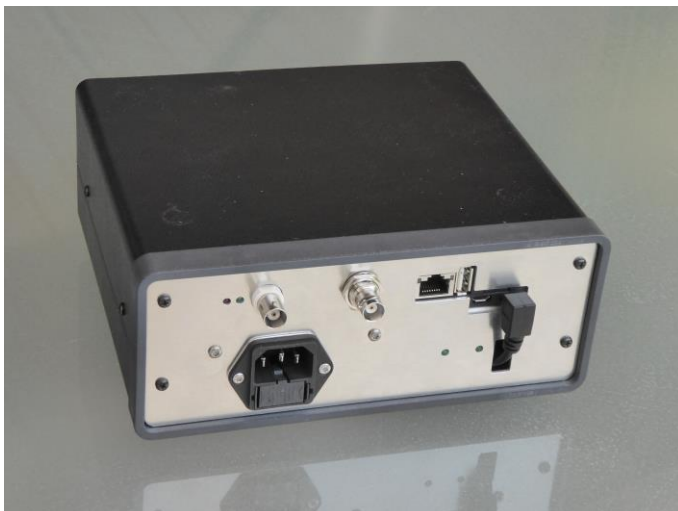
An ENAMS Receiver

At the 2017 IARU Region 1 Conference in Germany, considerable time was spent discussing EMC issues and the need for the monitoring of the RF noise floor. Two proposals emerged. The DARC (Germany) is working on developing a system that is close to the ITU-R measurement methods. They are using an active vertical antenna (active E-field probes). The receivers are based on a Red Pitaya ( https://www.redpitaya.com/ ) using different input bandwidths. Each receiver has a dynamic range of 100+dB. By applying two receivers in parallel the dynamic range is extended significantly. DARC plans to roll out 50 systems during 2019/2020.